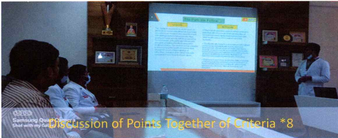
Discussion of Points Together of Criteria *8