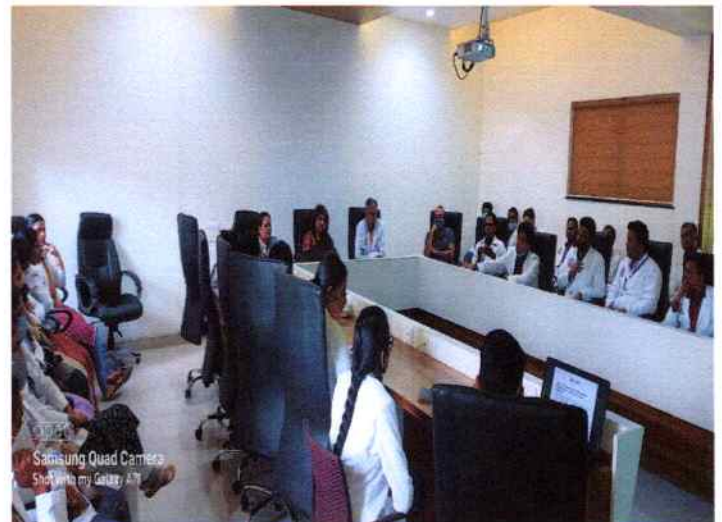
Discussion with Faculties