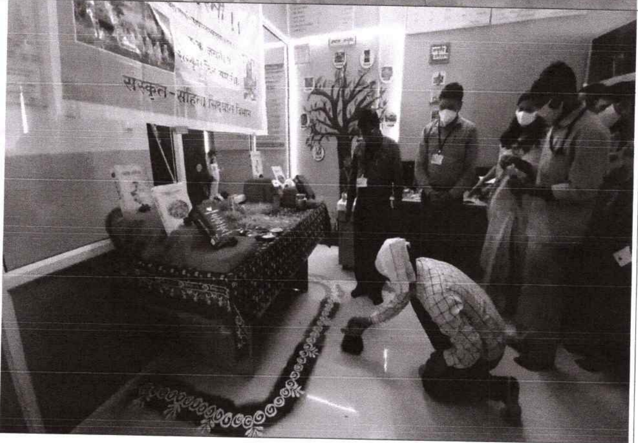
Charak Jayanti & Sanskrit Din Samaroh