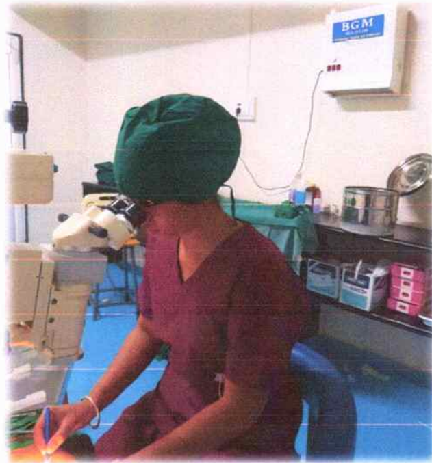
PG Students Demonstartion on Goats Eye 18/04/2022