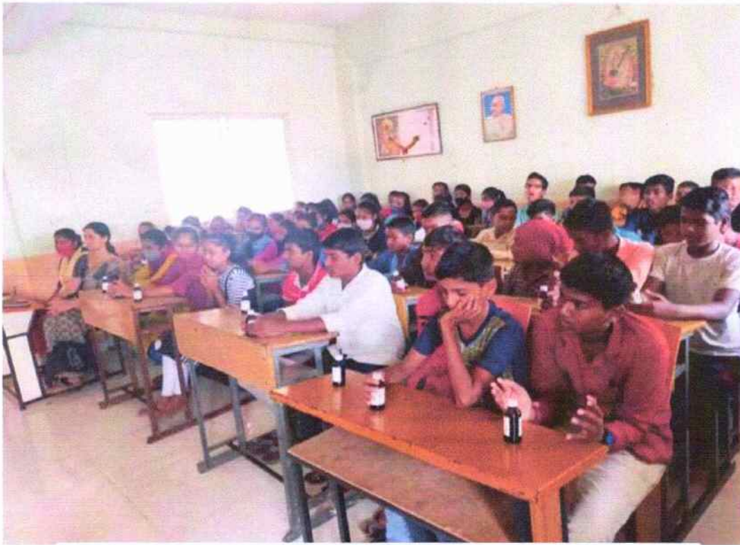
Distrubution of Ayush Kadha