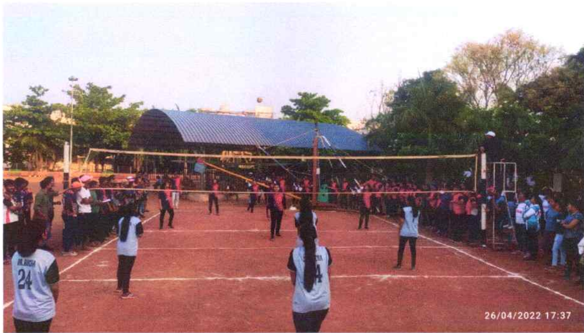
Some Photographs of sports events