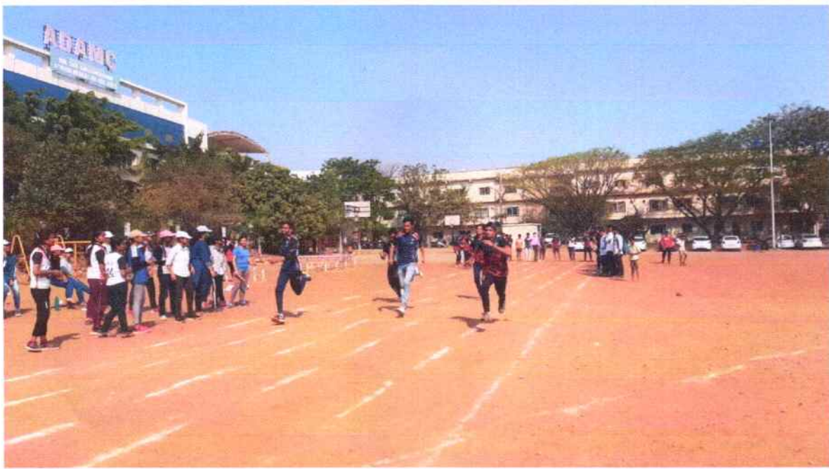
Some Photographs of sports events