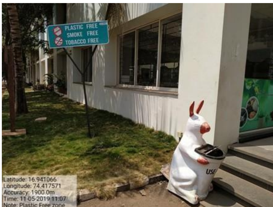
PLASTIC FREE ZONE