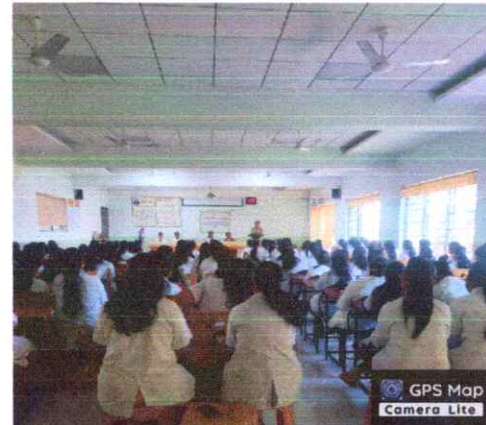
Hon. Shri. Annasaheb Dange Ayurved Medical College, Ashta, Anand Colony, Ashta, Maharashtra 416301, India

Latitude 16.94212205° Longitude 74.41600134° Local 11:27:44 AM Altitude 11.98 meters GMT 05:57:44 AM Monday, 09.01.2023