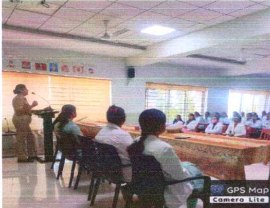
Hon. Shri. Annasaheb Dange Ayurved Medical College, Ashta, Anand Colony, Ashta, Maharashtra 416301, India

Latitude 16.94212205° Longitude 74.41600134° Local 11:27:44 AM Altitude 11.98 meters GMT 05:57:44 AM Monday, 09.01.2023