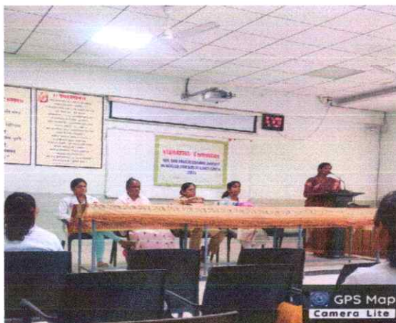
WCR8+HHC, Anand Colony, Ashta, Maharashtra 416301, India

Latitude 16.94210362° Longitude 74.41599421° Local 11:28:50 AM Altitude 11.98 meters GMT 05:58:50 AM Monday, 09.01.2023