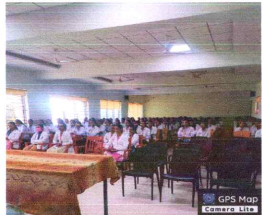
Hon. Shri. Annasaheb Dange Ayurved Medical College, Ashta, Anand Colony, Ashta, Maharashtra 416301, India

Latitude 16.9417548° Longitude 74.4172045° Local 12:12:52 PM Altitude 11.98 meters GMT 06:42:52 AM Monday, 09.01.2023