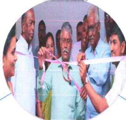
Chief Guest inaugurating kaushalya simulator skill center