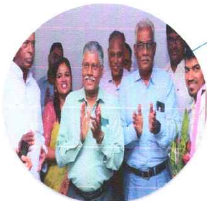
Chief Guest inaugurating kaushalya simulator skill center