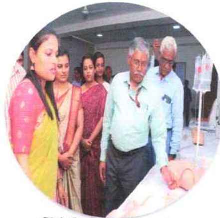
Chief guest observing a simulator