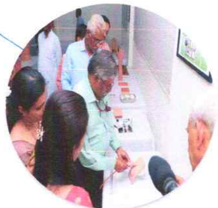
Chief guest experimenting catherization