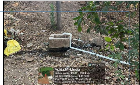
Waste water Recycling