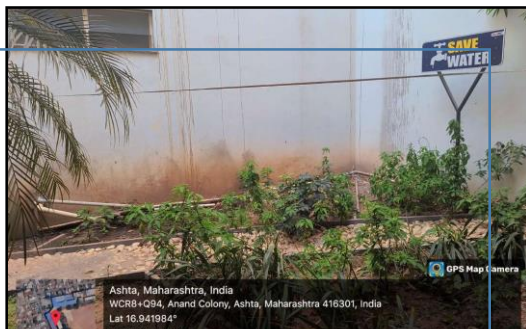
Irrigation to Garden