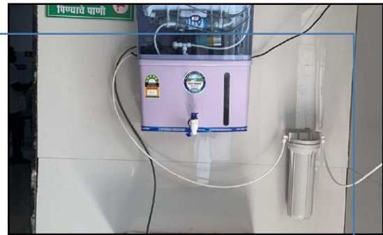
Drinking Water Supply