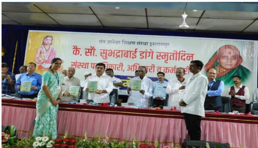
Sneh Melava appreciation of ADAMC Ashta by SDSS Islampur