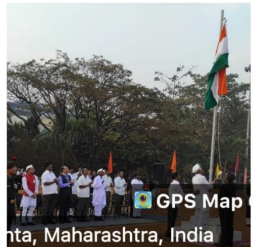
Republic Day celebration in Sant Dnyaneshwar Shikshan Sanstha