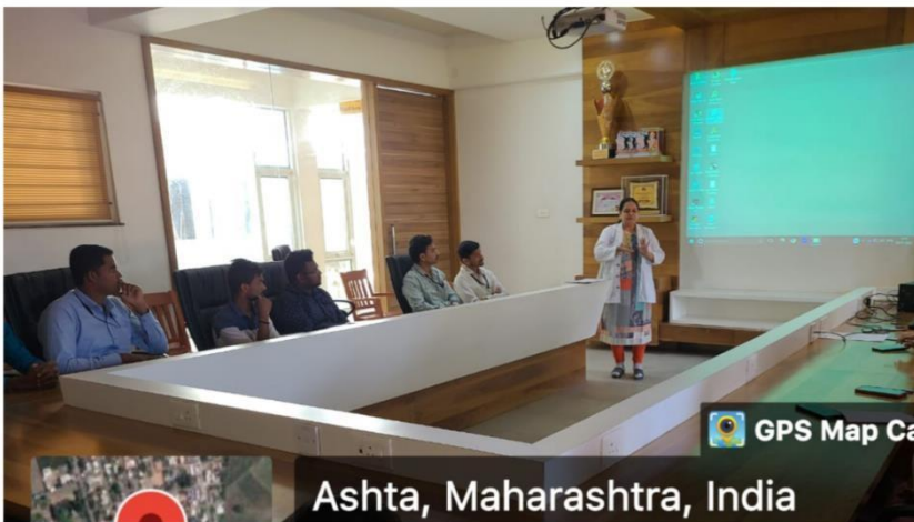
Reference Manager Mendeley Software training programme conducted by Research department