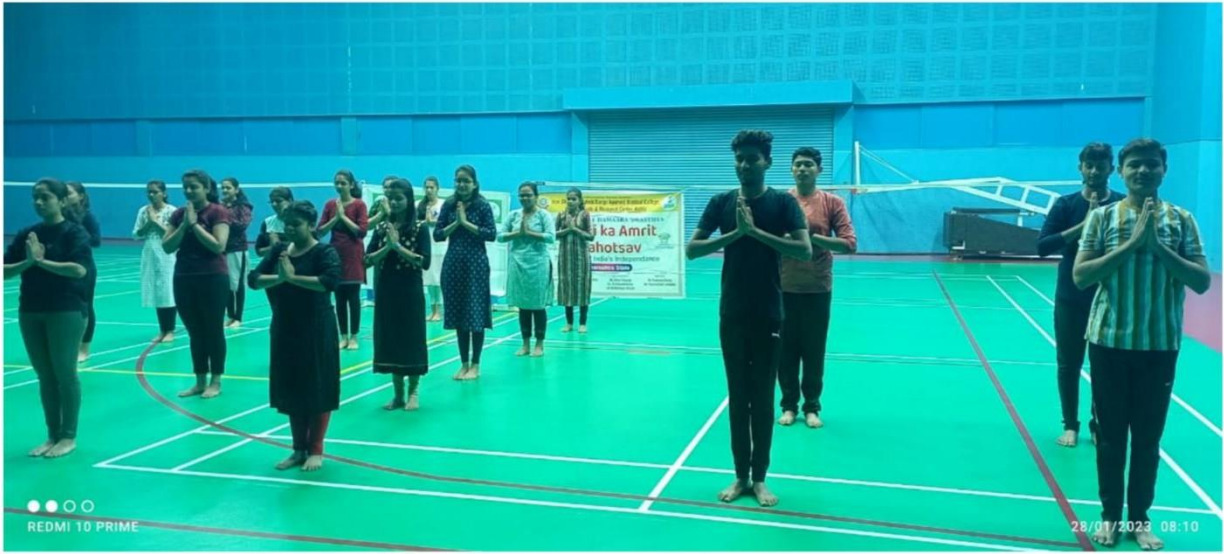
World Surya-Namaskar Day celebrated by Swastha-Vritta Department