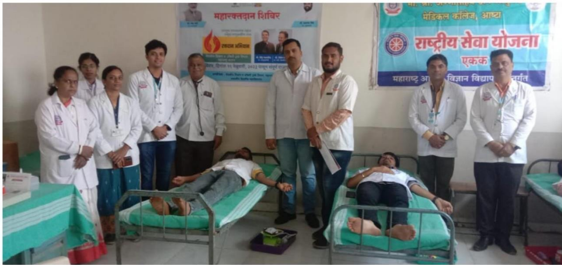
Blood donation camp on the occasion of Shivjayanti