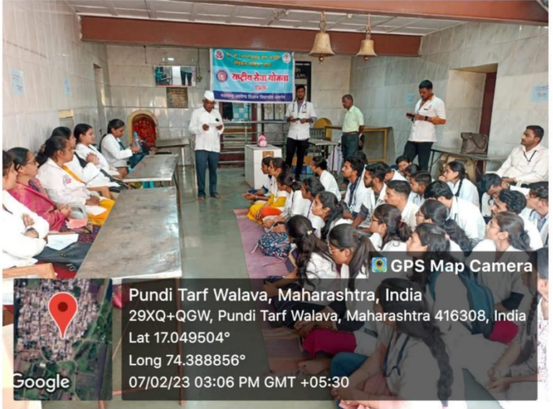
GPS Map Camera

Pundi Tarf Walava, Maharashtra, India 29XQ+QGQ, Pundi Tarf Walava, Maharashtra 416308, India Lat 17.049504° Long 74.388856° 07/02/23 03:06 PM GMT +05:30