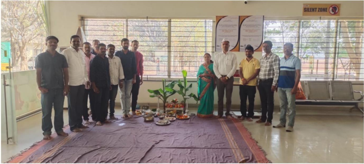
Vardhapan din of ADAMC Celebrated on 1st Jan