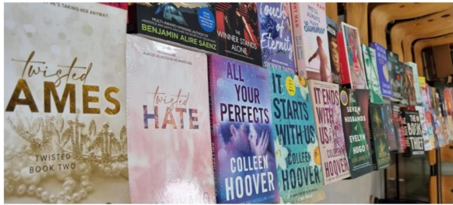
Book Exhibition by Sharir-Rachana Department in collaboration with 'Granth Book World', Kolhapur

Yuva din celebrated on the occasion of Swami Vivekanand Jayanti & Rajmata Jijau Jayanti