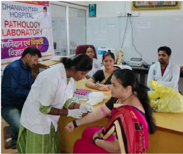
CA 125 check up Camp organised by Rognidan dept.