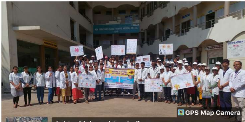
Cataract & Thyroid Awareness Rally by Shalakyatantra dept