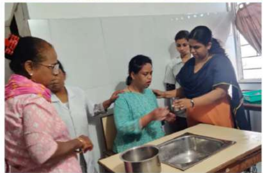
Vasantik Vaman Camp organised by dept of Panchakarma