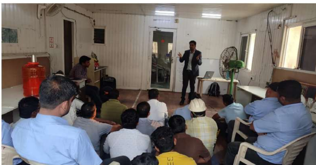
Industrial Training on the occasion of 52 National Safety week 2