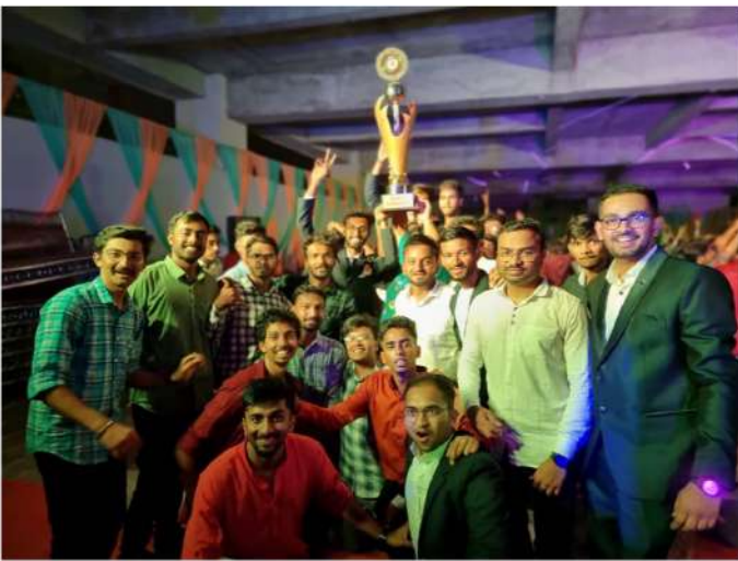
Jaguars Won General Championship