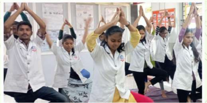
Pavan Yoga Course organised by dept of Swasthviritta