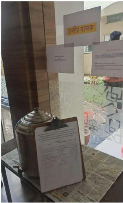
Ushir Panak prepared by dept of Rasshastra & Bhaishajya Kalpana