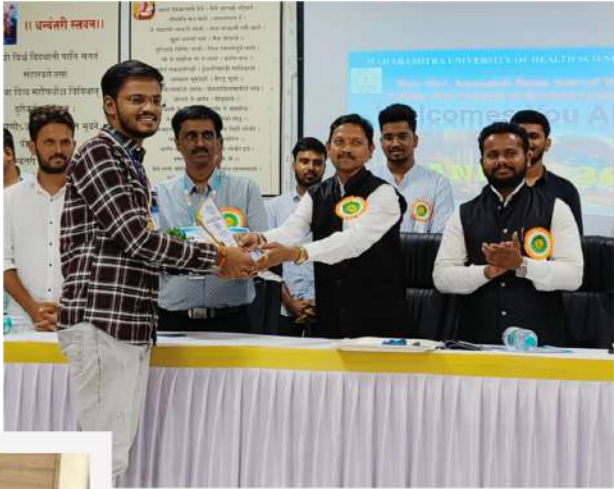
Believers team won short film competition in spandan (MUHS)