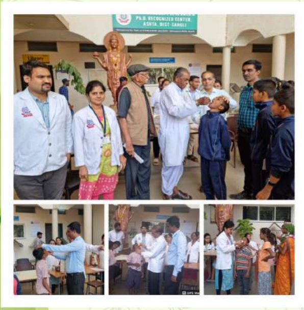
Suvarnprashan Sanskar conducted by dept of Balrog dept.