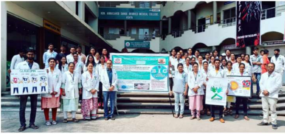
Awareness rally by dept of Shalakyatantra