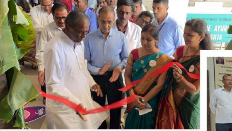
Millets Exhibition by Dept of Dravyagun Vigyan