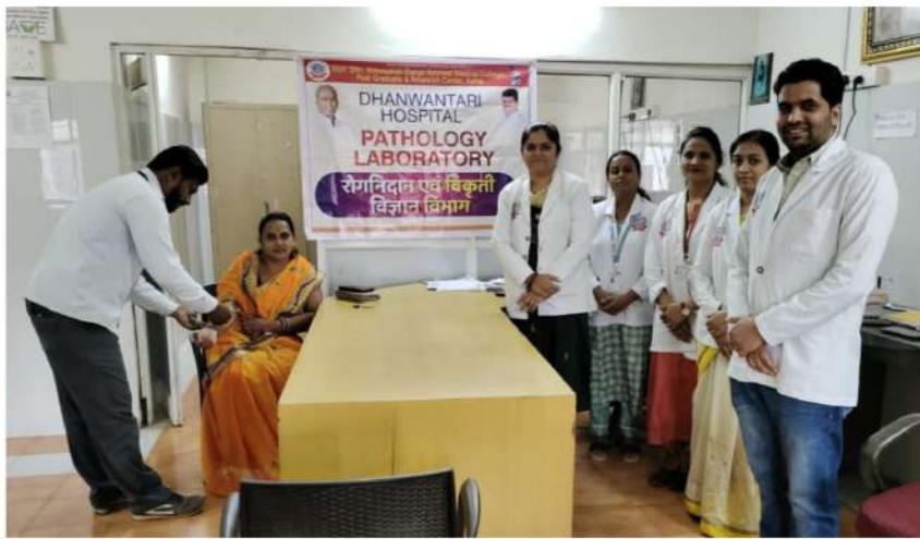
Thyroid function test camp organised by Rognidan Dept