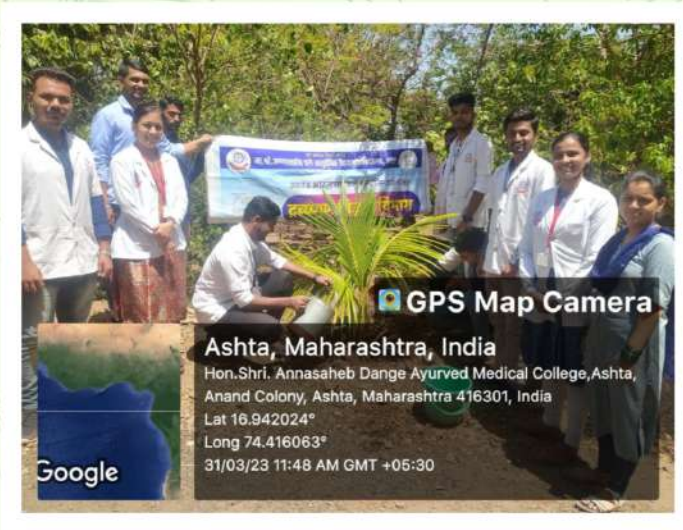
Tree Plantation by Dravygun Vigyan