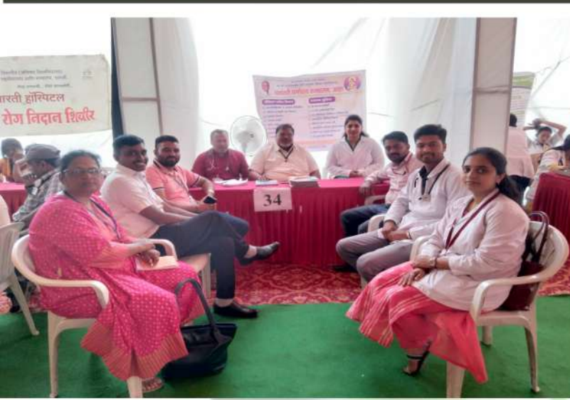
Dharmaday Yojna Maha Arogya Shibir Kolhapur.