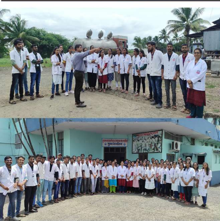
Industrial Visit at Hutatma Dudh Sangh Dairy, Walwa & Dindayal Sutgirni, Islampur.