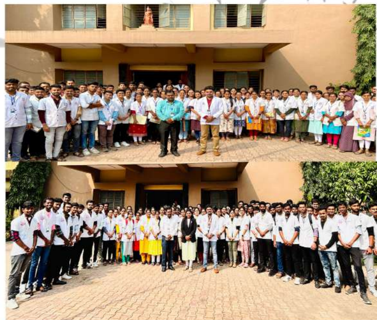
IIInd & IIIrd year students visited to Sub-District Court, Islampur by Agadtantra Department.