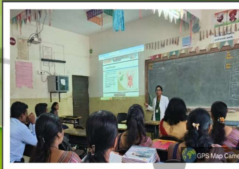
Shardiya Virechan Camp Organised by Panchkarma Department.