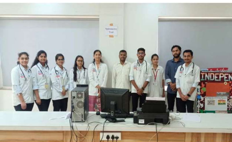
Spirometry Test Camp organised by Kriya Sharir Department.